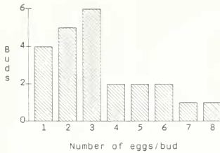
Fig. 1. Number of eggs of L. boeticus on buds of C. spinosa .